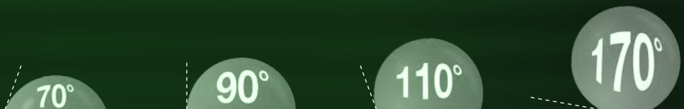
Water droplet angle on: Steel Waxed Car Windshield Coating Ultra-Ever Dry®

Superhydrophobic - superior water repelling property that causes a water droplet to have a contact angle that exceeds 150 degrees.